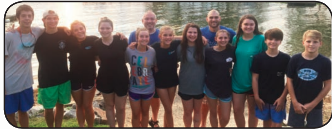
YOUTH BAPTISM AT THE LAKE ON AUGUST 14, 2016